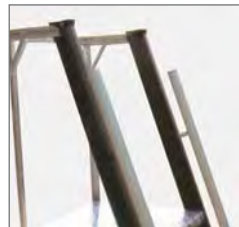
Wide platform 20"x20" with heavy duty siderail & handrail.